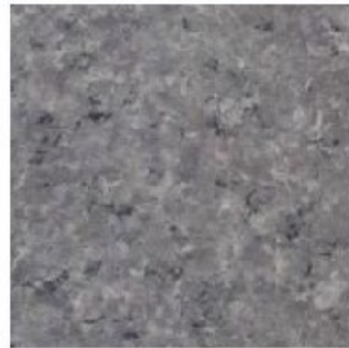
0204 - Dark Stone