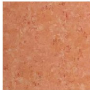
0209 - Orange Fire