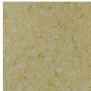
0201 - Yellow Desert