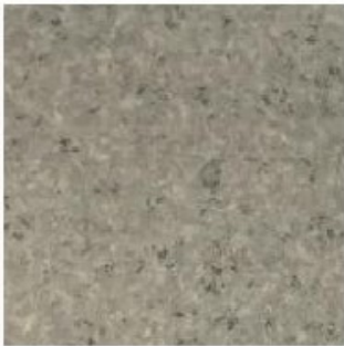
0203 - Light Stone

Size: 2.0mm (T) x 2m (W) x 20m (L) - Layer 0.35mm