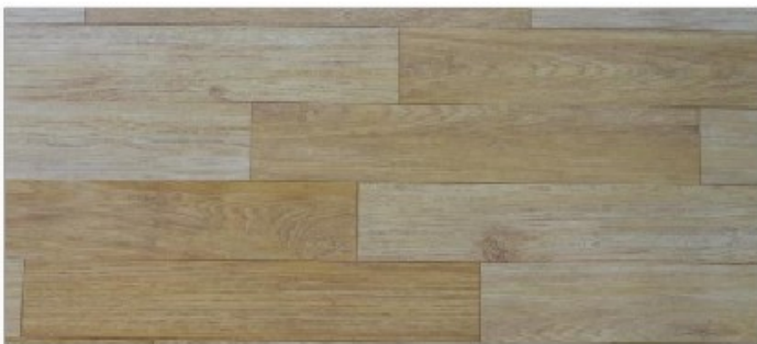
0028 - Light Wooden Earth