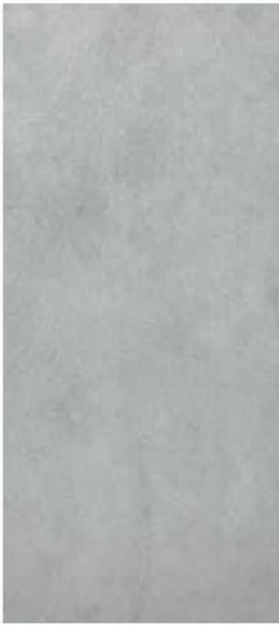
0807 - Light Grey Moon

Size: 2.0mm (T) x 2m (W) x 20m (L) - Layer 0.6mm