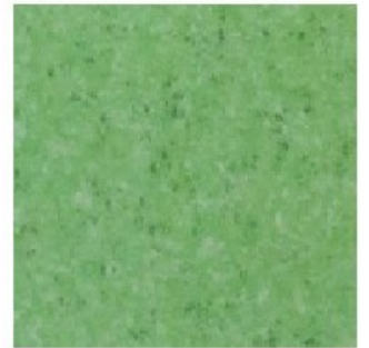
0202 - Green Forest