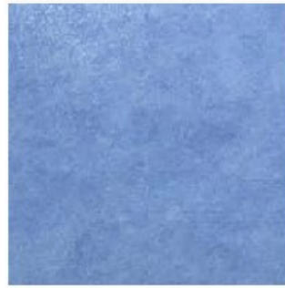
0806 - Blue Sky