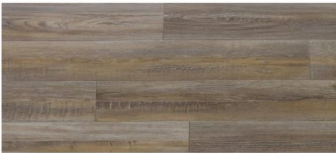
0501 - Dark Wooden Earth