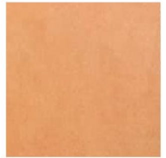
0809 - Orange Sun