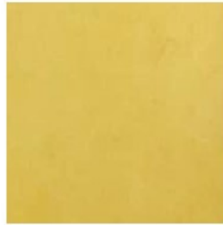
0801 - Yellow Sand