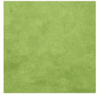
0802 - Green Grass